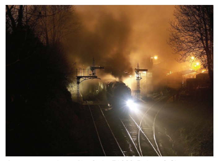
An amazing sight at Alresford. 71000 Duke of Gloucester is waiting to leave with the Cathedrals Express mainline steam special to Waterloo.