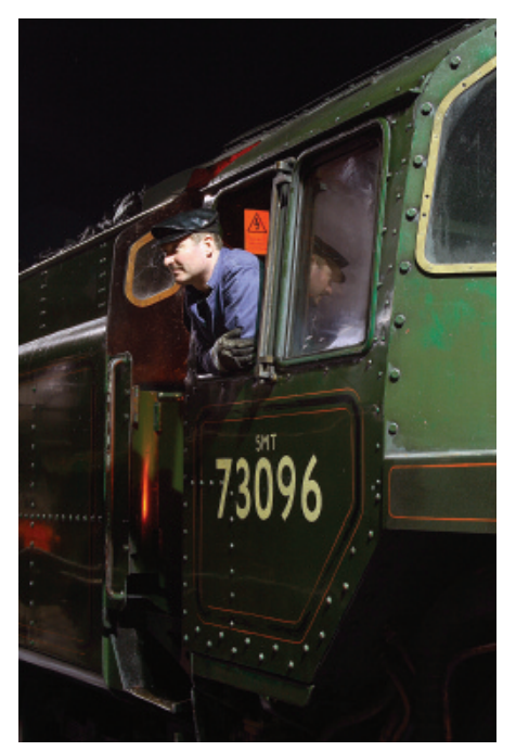
The Fireman of 73096 awaits the signal to depart, the fire from the firebox can be seen reflecting on the cab.