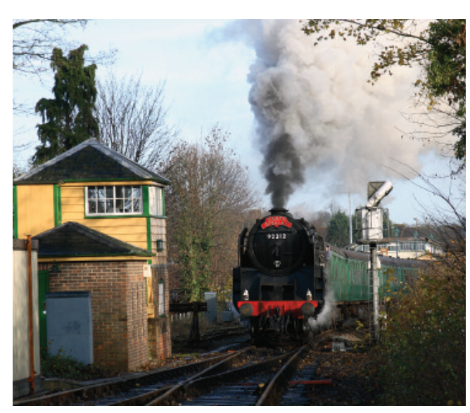
A train departing Alton and the start of the passing loop just outside the signal box is just visible.