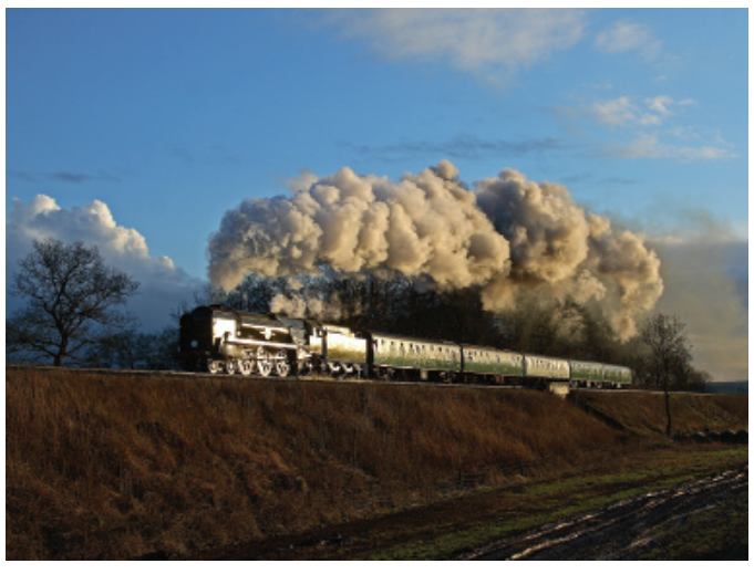
Early Spring can produce some stunning light, here 35005 Canadian Pacific is illuminated to great affect.